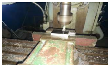
Figure 1. The milling process of making a specimen.

After the specimens had been machined per experimental plans, each specimen's surface roughness was measured as shown in Fig. 2.