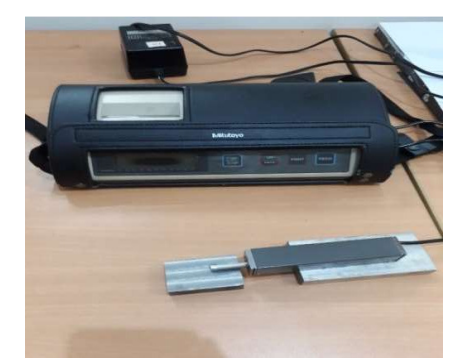
Figure 2. The surface roughness measuring of a specimen

Further, all the observed data were analyzed by using two-way ANOVA with the help of computer software.